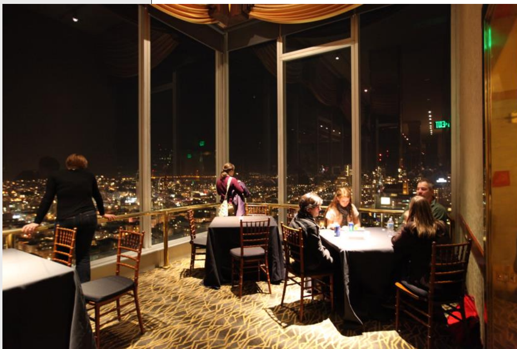
The Diversity Social in the Cityscape Room in San Francisco.

website, so that our committee can better serve those members who seek mentors at the meeting and hopefully beyond.