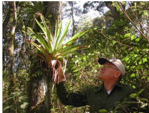
David Wake hunting salamanders in a Mexican cloud forest.